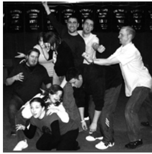
Group therapy: College kids act out their issues.

EMU's Playback Theatre takes its scripts from the audience